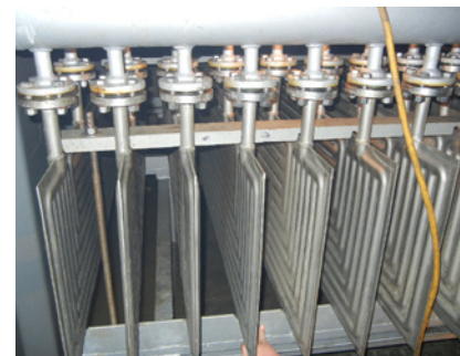
Delivered panels were clamped in rack stands and their inlet/outlet flanges connected to media distribution and return headers.

MSRC operates a fleet of Responder-class Oil Spill Response Vessels (OSRVs) that receive recovered material to their holds, where it is heated as needed to accelerate gravity separation of oil and water phases. Following separation, or knockout, the OSRV crew shuts down heating unless the weathered oil is very viscous, in which the heating is continued until the ship reaches port to maintain a pumpable viscosity.